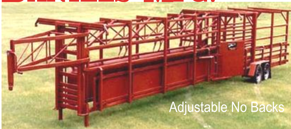
Adjustable No Backs

Portable Double Alley (32') $ 16,099 (38') $ 17,895 (44') $ 19,415