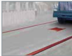
SURVIVOR ® PT Pit-type concrete or steel deck scales