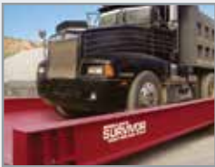
SURVIVOR ® SR Extreme-duty, low profile concrete or steel deck siderail scales