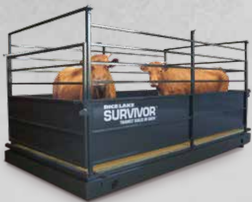
SURVIVOR LS Series pictured here with custom racks and gates.

In a market crowded with scales manufactured to compete on price alone, Rice Lake's livestock scales are built from the ground up for lasting performance under the most severe conditions. Whether you choose the RoughDeck ® SLV single animal scale or the SURVIVOR ® AG, LV or LS, you're getting the Toughest Scale on Earth. ®