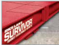
SURVIVOR ® OTR Top access, low profile concrete or steel deck